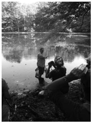
Maple Flats Fieldtrip