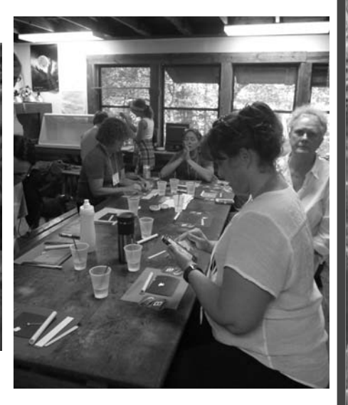
Metal clay pendants